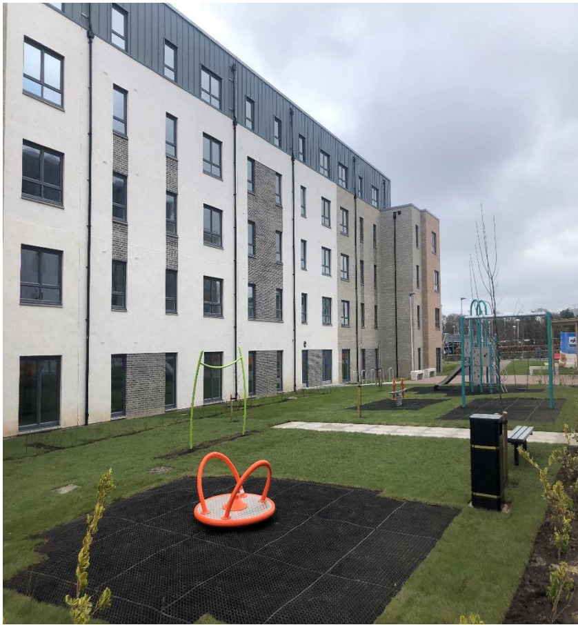
Block 4: External