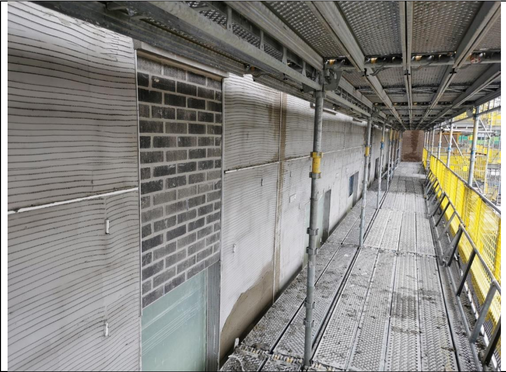
Block 2 Render Basecoat to West Elevation