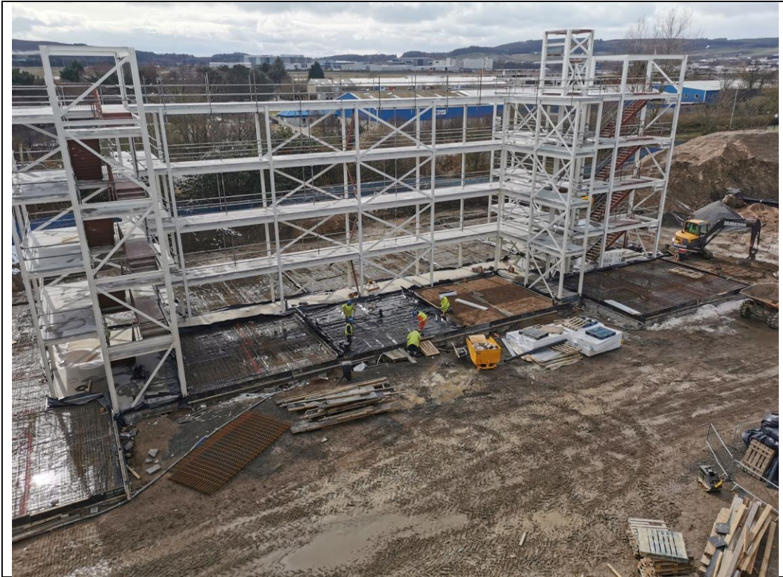
Block 1 Overview