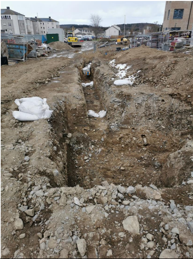
North Elevation District Heating Installation to Block 2