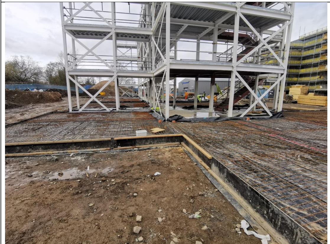
Block 1 Prep for Concrete Pour