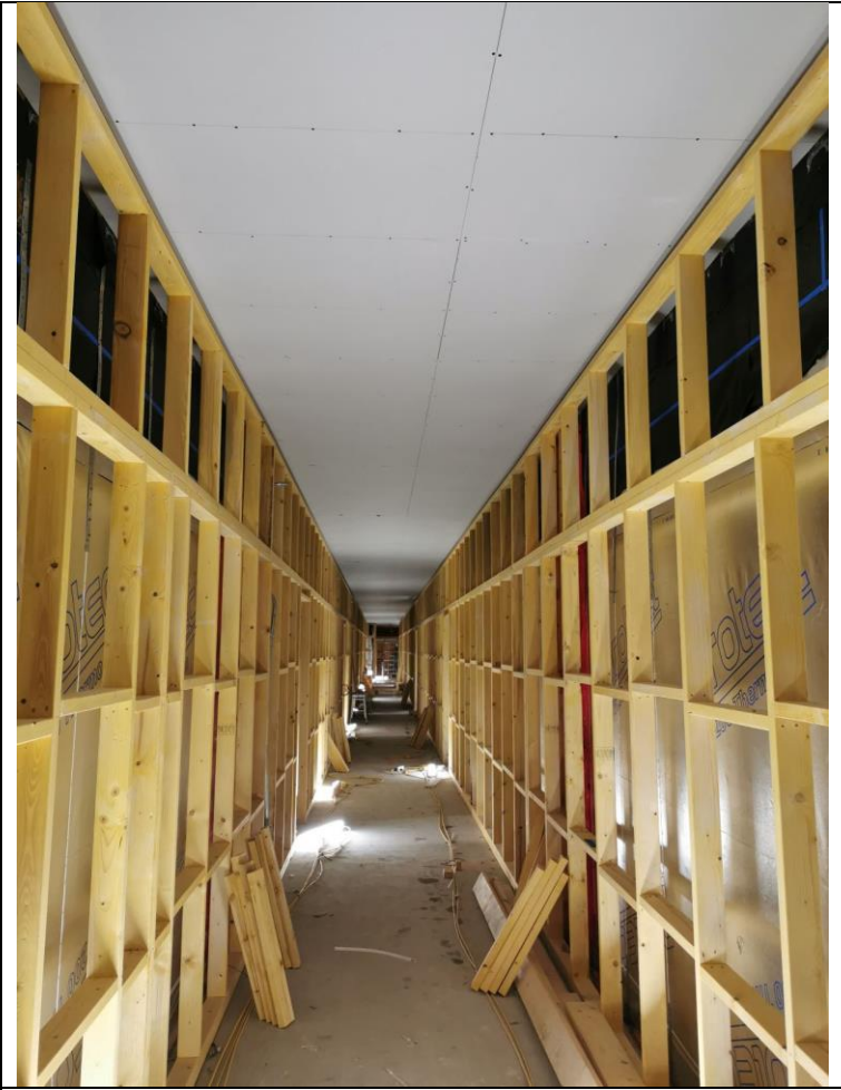
Block 2 4 th Floor Corridor